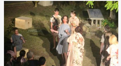
Students in Shakespeare Appropriation Wandering Shadows