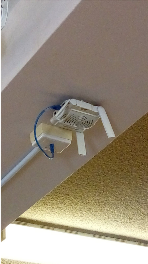
The Current WiFi Routers.