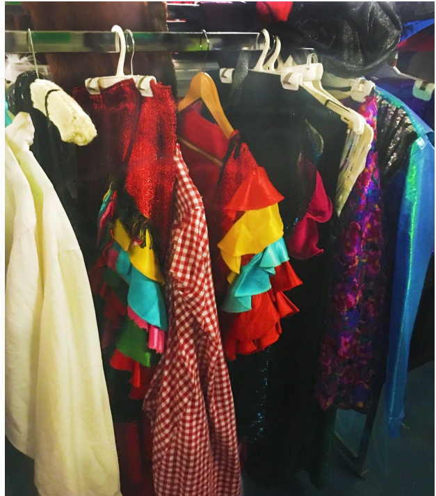
Costumes for the Musical