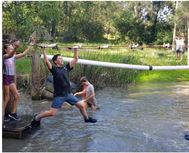
Students learned to work together and had a lot of fun doing it!

Ben: Camp was awesome but I wish that I could have done all the activities again and again!