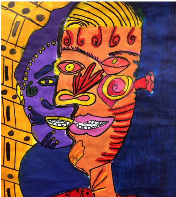
A Picasso inspired artwork, evidence of the variety of techniques studied at Cromer.