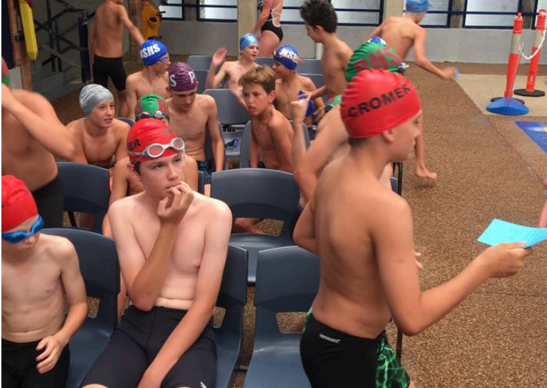
A nervous group of Cromer boys waiting to compete in their races at the swimming carnival

Country in May. In the last few years at Cromer the cross country has been arranged by the teachers but this year someone lucky in year 8 has got the opportunity to design the course for the whole of the school and it will be interesting to find out how extreme the course will be. Early rumours suggest that the course might even travel across the harbour bridge. Some people are even arguing that the Cross Country Path will travel across Uluru. This requires further research in subsequent issues of The Cromer Scoop.