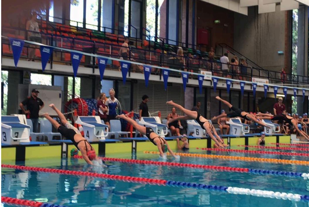
A fierce Under 14 Girls Freestyle heat at the Zone Carnival last year.