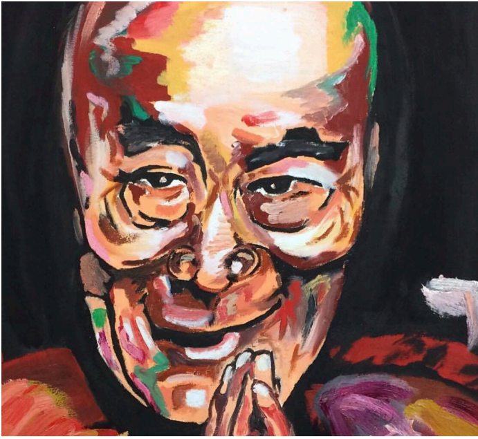
One of the breathtaking anonymous works at Cromer.

divulged this information during a private interview, and didn't intend on revealing that kind of gossip but it accidentally came out whilst we were on the topic of personal art works.