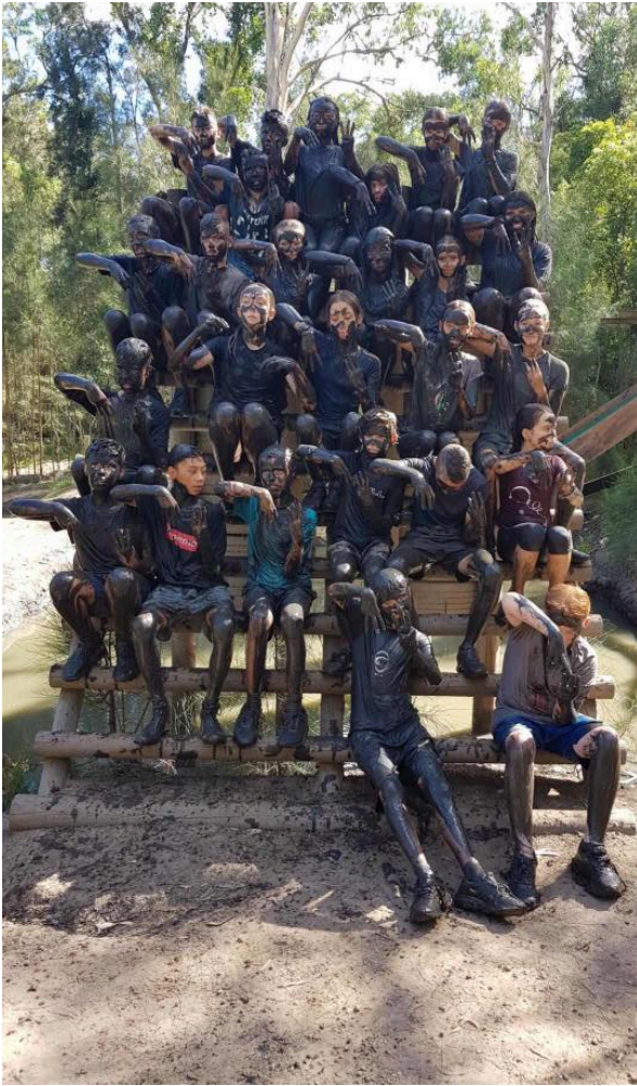
Images after the infamous Mudworld, a controversially messy camp activity.

Deemed a success by our year advisor, she said she was particularly proud of the relationships we built over the two day camp.