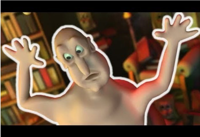
One of the memes which caused the internet at Cromer to Crash when hundreds of students rushed to access it.

Despite accusations flying that technology is in a state of crisis at Cromer, the blame may lie in two unexpected places. Cromer's Tech Team has expressed that issues with projectors are caused from people leaving them on and causing the projectors globe to blow. Another major issue is that students are rushing to be the first to download the latest memes and this is absorbing a significant amount of bandwidth.