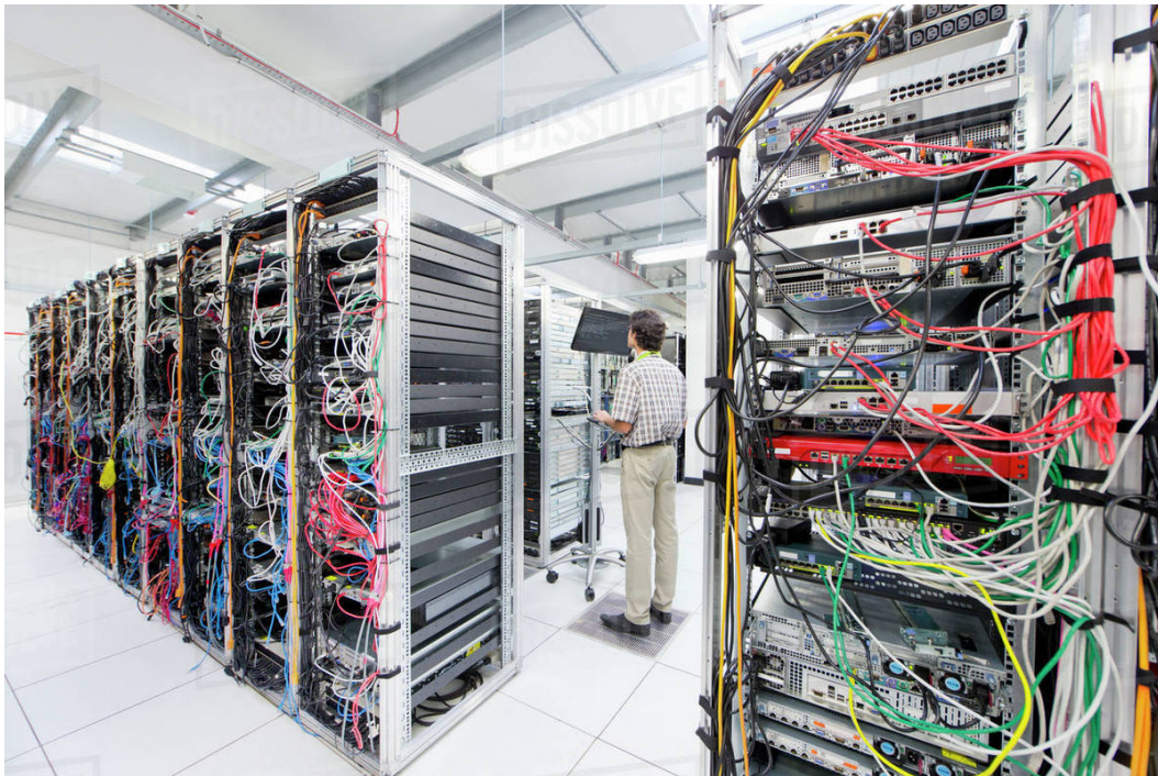
A strained server room at Cromer Campus.

No internet for days, Tech Team don't know the memeing of the malfunction.