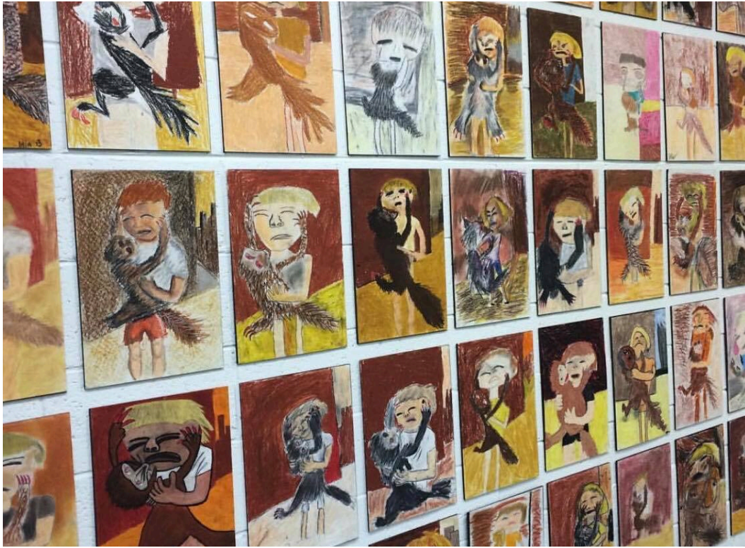
Some of the amazing art at Cromer Campus this year.