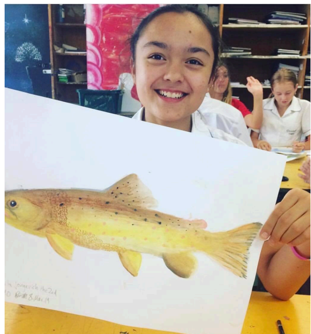
A talented student who may be affected by the threat to resources at Cromer.