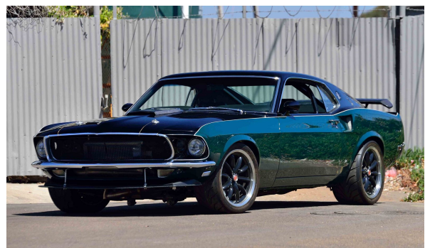
The reported prize for breaking records at the carnival this year.

The final carnival at Cromer Campus is the Cross