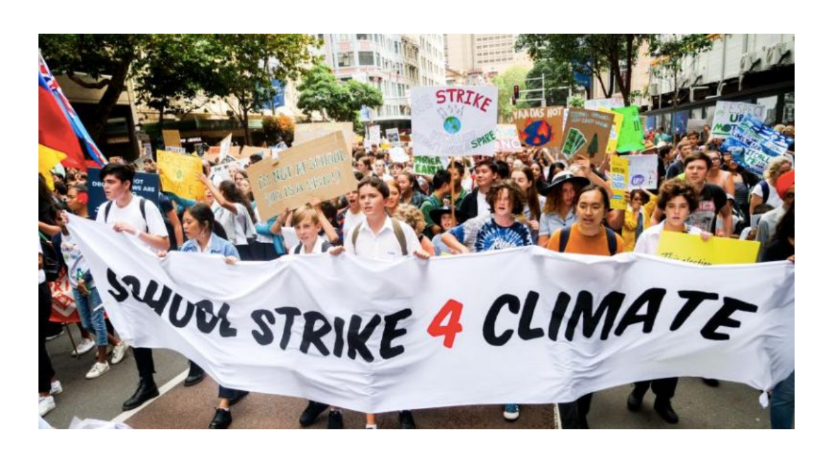
Above: Sydney students strike for the environment

mathematical theory. It was founded due to the few mathematical competitions and lack of students participating in each. The competition involves countries choosing two teams of up to four students along with one teacher or advisor. The team of students must decide on 5 consecutive days in which they all agree to work on the problems and hand their solutions into the advisor or teacher at the completion of the problem. The contest will begin mid-March and end early May.