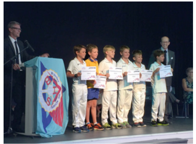
ABOVE: The Design, make, Innovate awards at NBSC Cromer Campus (LEFT) and NBSC Balgowlah Boy Campus (RIGHT).

Design Make Innovate (DMI) is a design and technology project involving over 900 students