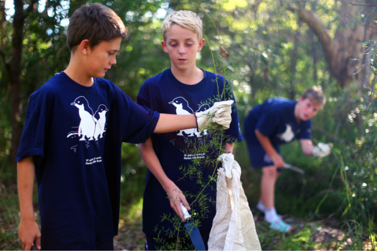
ABOVE: Students from NBSC Balgowlah Boys Campus bagging non-native plant species on the Collins Flat Beach headland last Thursday.