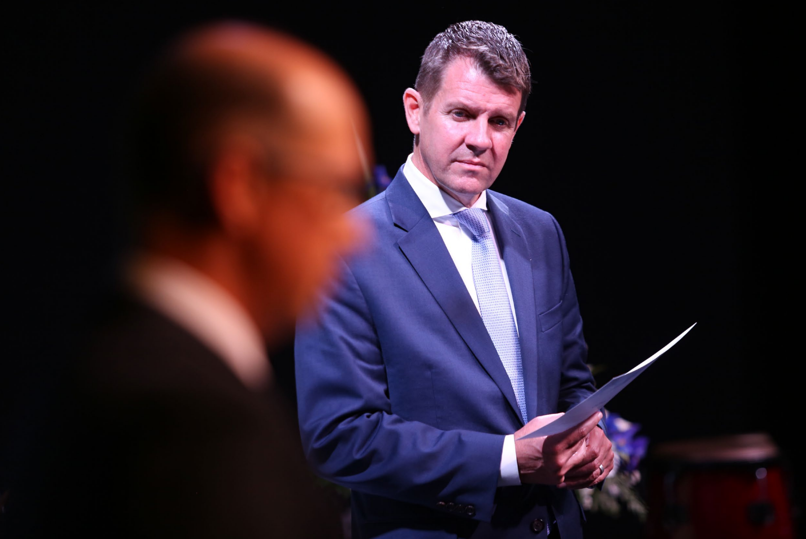
ABOVE: Former premier of NSW Mike Baird presenting the awards to NBSC Manly campus staff as the college principal read the citations.