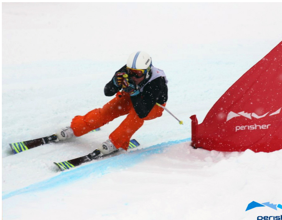
ABOVE: The action on the ski fields was captured by some devoted and supportive parents.