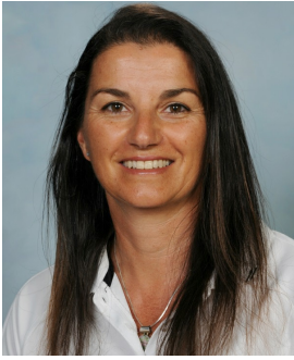
BY SANDRA BONELLO NBSC Project Officer

The Little Penguin is the smallest species of penguin closest colony living in Manly. Taronga Zoo in combination with NBSC Campus students and local Primary School students has once again embarked on an awareness campaign, to educate the community on conservation of the penguin environment.